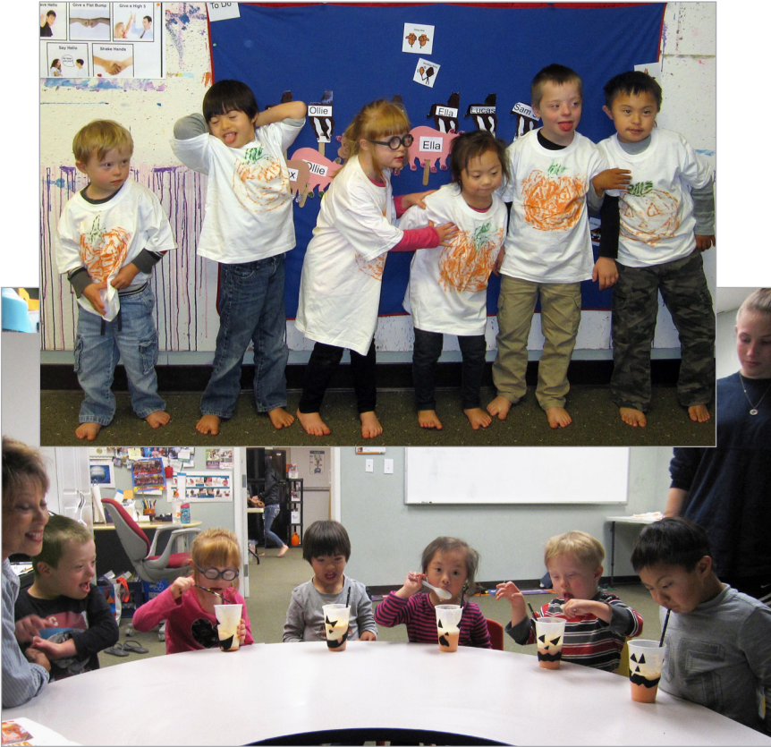
Two photos below: Danville's Early Elementary class enjoyed some Halloween fun with self-decorated T-shirts and jack-o'-lantern drinks.