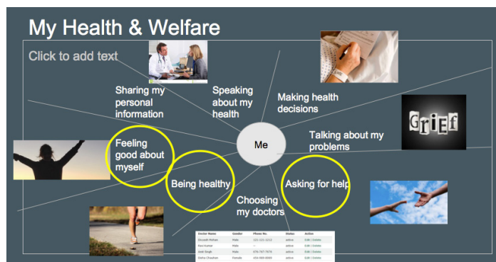
Lifemap – After each lesson, participants create a life map to highlight their priorities.