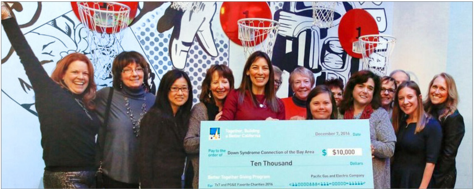
DSCBA staff and board members happily accept a check for $10,000 from PG&E.