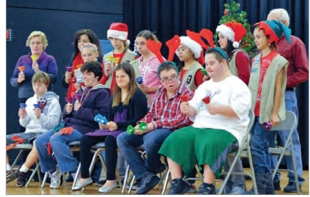
From page one – more holiday photos.