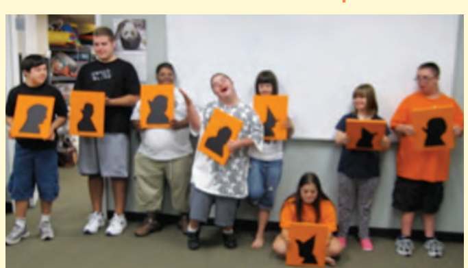
Next Step classmates make their own Halloween silhouettes for a class project.