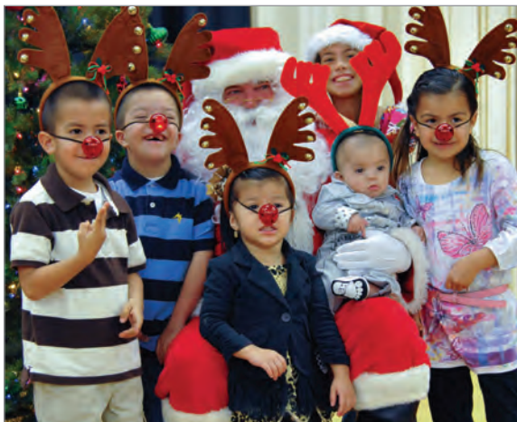
See more Holiday photos on page 2