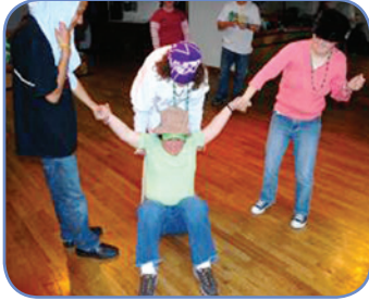
Janis with a Little Help from Her Friends