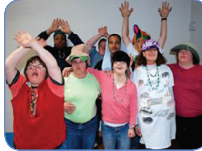
The Step Out Team