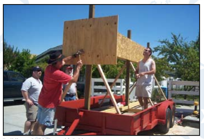
Building a Solid Float with Pride