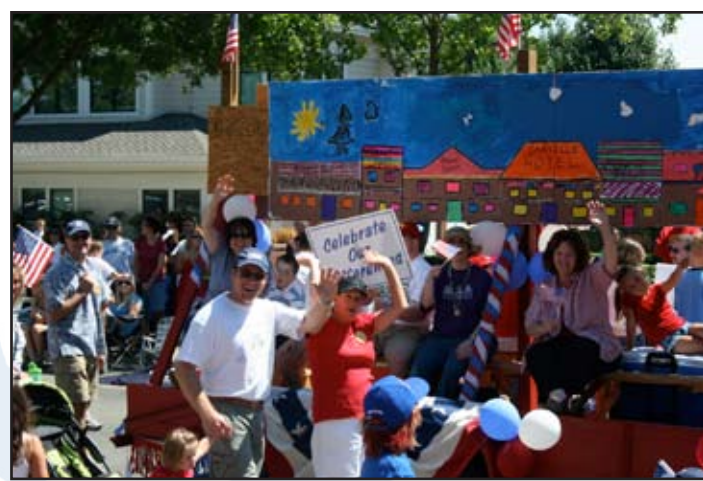
Celebrating With the Crowd