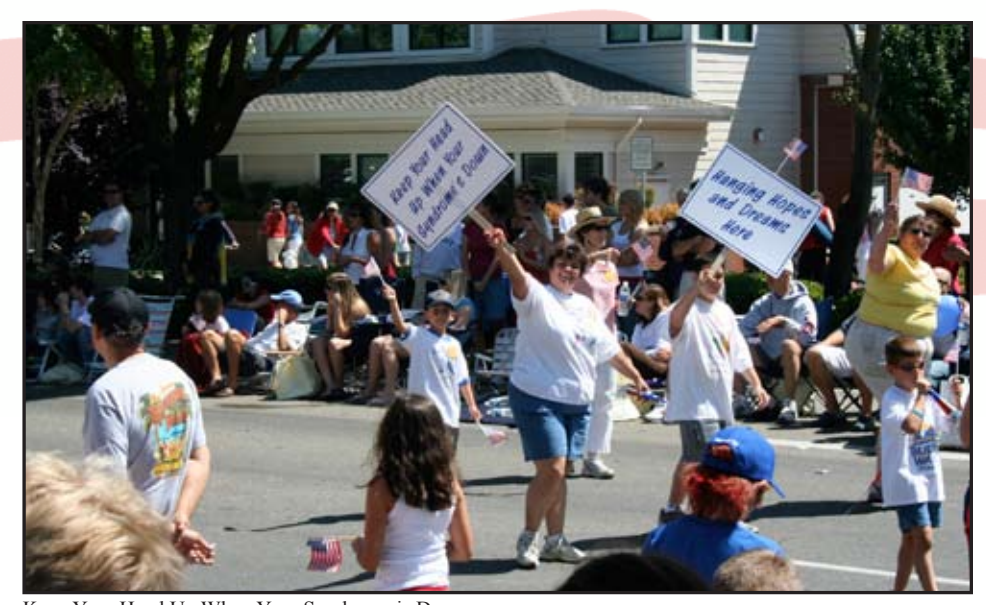
Keep Your Head Up When Your Syndrome is Down