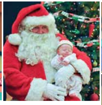
Top left: Craft time! Above: My first DSCBA holiday party. Top right: Enjoying cookies.