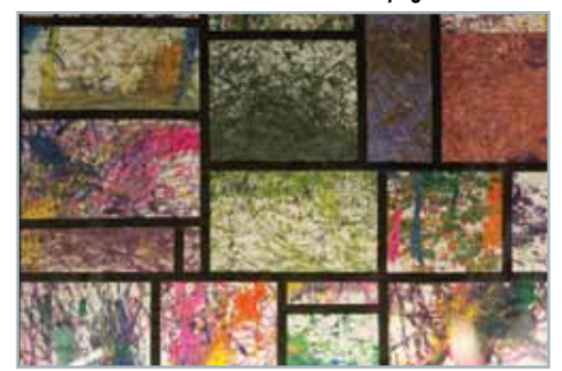
Peer Development Gallery exhibit samples: see pages 6-7