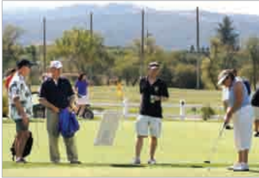
Table for 10