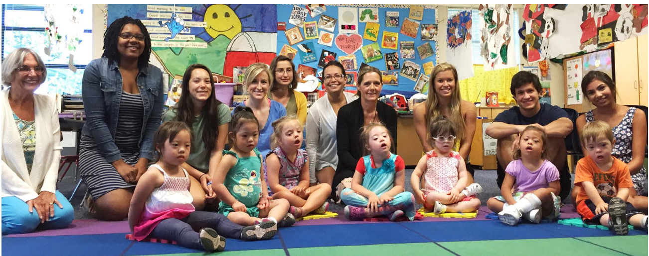
The "Roos" class in the summer Communication Readiness Program. Each year we employ a stellar CRP staff. In 2015 all 15 students made significant progress.